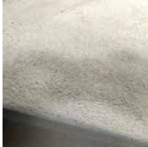
CONCRETE REFRACTORY DOME

The Napoli Outdoor Oven™ is always evolving. That philosophy is reflected in its features. We've refined these features to give you a cooking experience that's both simple and stunning.