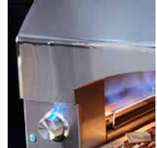
SEAMLESS WELDED CONSTRUCTION