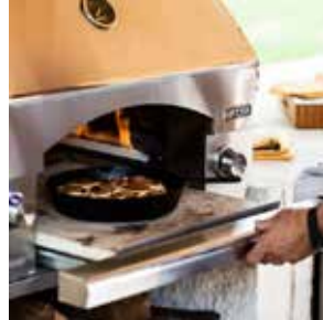
MOVEABLE COOKING SURFACE